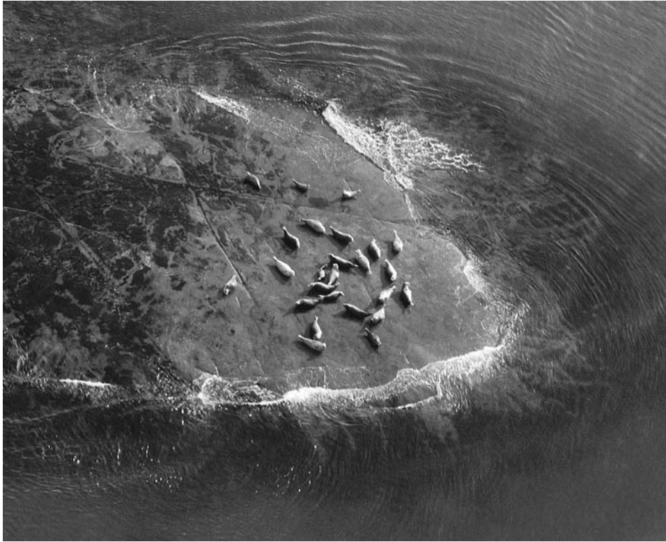
PLATE 1. Hauled-out harbor seals photographed during aerial surveys.

adjusted to conditions of the covariates that yield the maximum counts (we call these the optimum conditions). Observed counts are adjusted to optimum conditions because it is not possible to be at every site at low tide at noon every day of every annual survey period due to tidal fluctuations, weather, and logistics (Ver Hoef and Frost 2003). The optimum date for both quasi-Poisson and negative binomial regression was the earliest date, 18 August. However, the adjusted estimate of harbor seal abundance using a quasi-Poisson regression was 38 884 on 18 August, while using a negative binomial regression it was 80 609. Clearly, the choice of the regression method has a large impact on our abundance estimate.